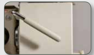
Lever Linked Footrest Opens and closes footrest without the need to bend down. Powered option also available.