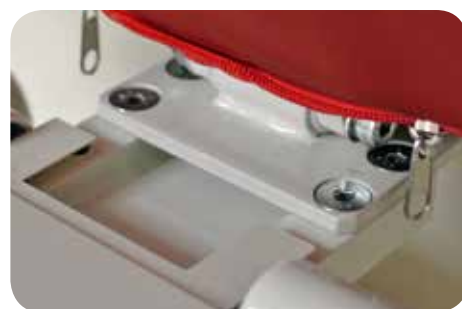
V4 Adjustable Seat Plate