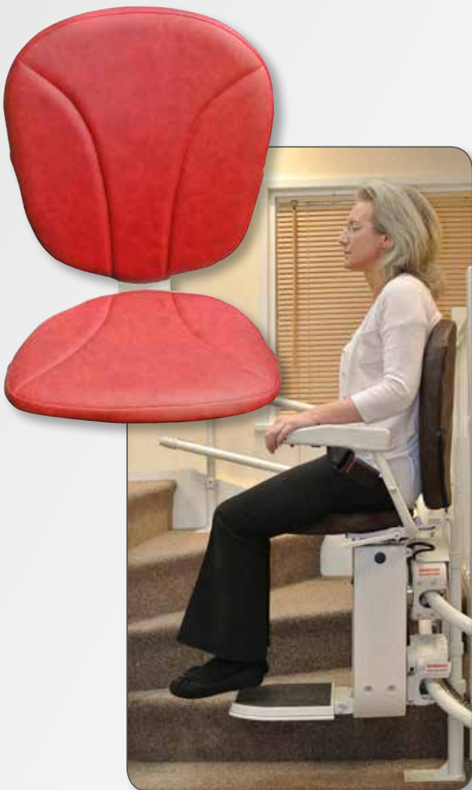
ergo standard seat