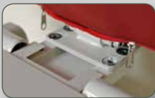
V4 Adjustable Seat Plate Allows for horizontal adjustment of the seat back. Combined with the multi-position seat pad, the ERGO offers multiple configuration options.