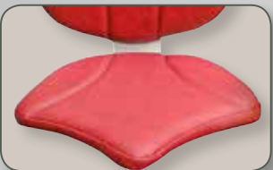
ERGO Plus Pad Maximum comfort for shorter legs.