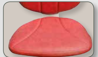
ERGO Standard Pad Designed for maximum comfort.