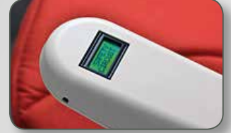
Digital Arm Display Easy to read, real-time diagnostics.