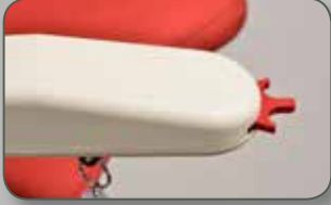
Ergonomic Joystick Total control at your fingertips.

The Platinum ERGO seat is one of the most advanced stairlift seats available. The ERGO is fully adjustable to the size and shape of the user and comes with a wealth of built-in features. The ERGO seat comes as standard on the Curve. Ask your distributor for more details.