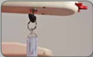
Security Lock Prevent unauthorised use of the lift.