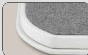
Safety Edge Senses obstructions and brings the chair to a stop.