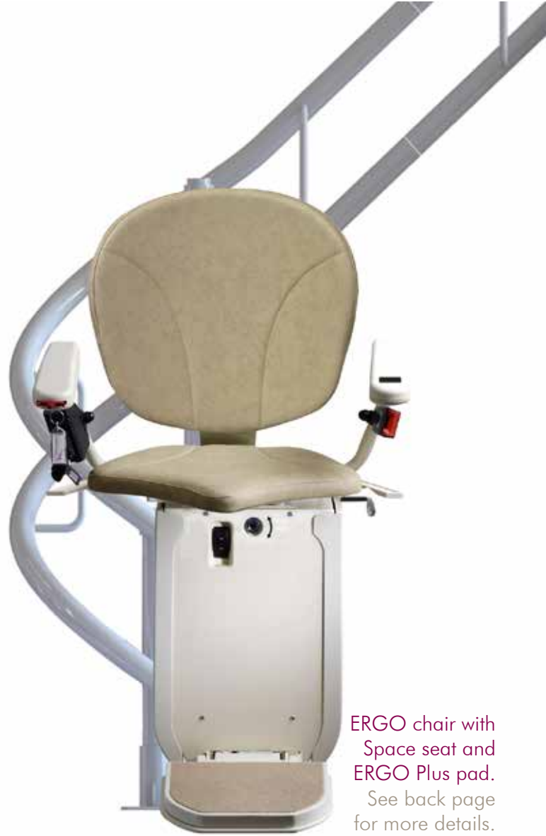
ERGO chair with Space seat and ERGO Plus pad. See back page for more details.

For curved staircases, there is no better option than the Platinum Curve.