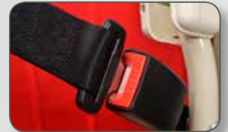
Retractable Safety Belt Additional safety when lift is in operation.